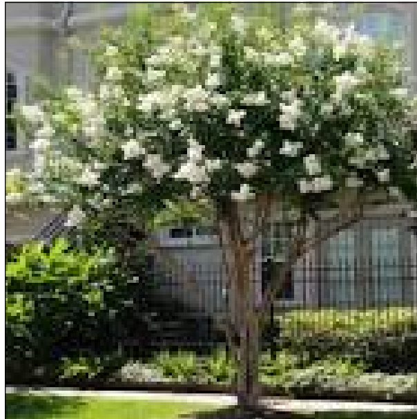
CRAPE MYRTLE: A white Crape Myrtle sapling (left) as well as a nearby pink one, were recently planted alongside the Spring Knolls clubhouse and will someday provide shade (like the one pictured above) for those using the grassy area to walk their dogs. The two saplings, which can grow to 30 feet, will eventually show flowery blossoms all summer. The trees were planted to replace two palm trees removed several months ago as fire hazards.