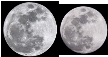
A Supermoon at moonrise (left) as compared to a Micromoon (right)

As with any contemporary publication, articles submitted will be edited for spelling, punctuation, grammar and clarity using tools such as spellcheck and/or Grammarly.