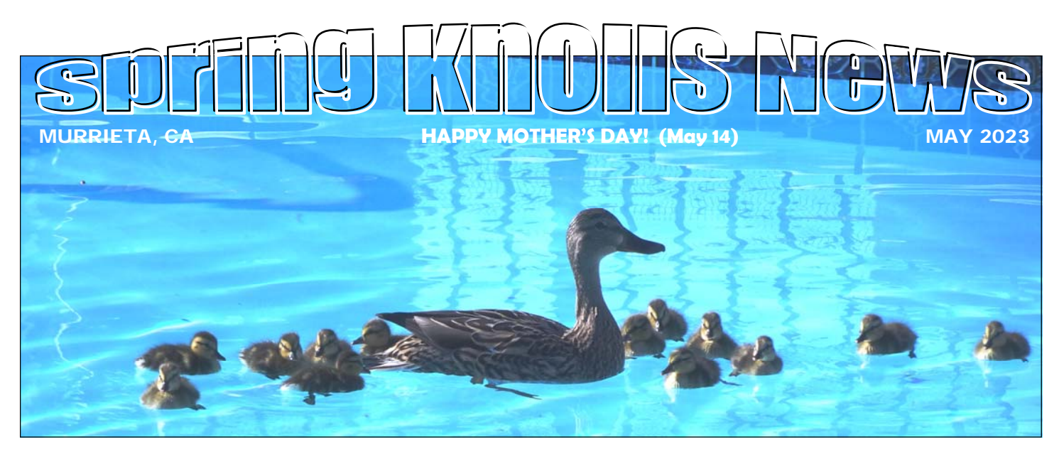
The same duck who last year brought 10 ducklings into the world, swims with her new brood of 13 in the Spring Knolls pool on April 6. Details Page 4