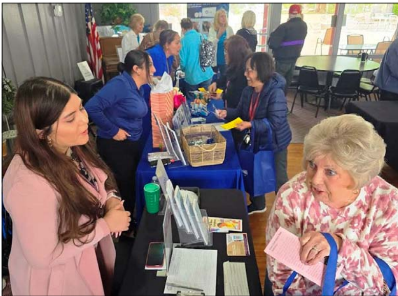
Several presenters provided fairgoers with information and literature in both English and Spanish as well as advice for follow up calls and appointments.