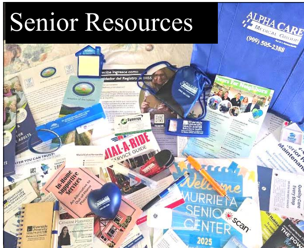
A bounty of literature, business cards and souvenirs is shown in this array. Fair goers filled bags (provided by Alpha Care ) with items found at most tables.