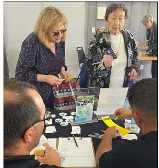
Favors for Neighbors , a first-time exhibitor, explains to fairgoers how the organization provides dozens of services to area residents.