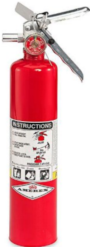
Class ABC (small)