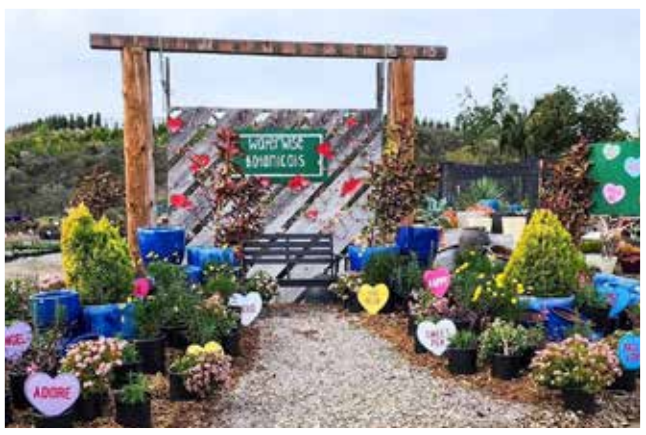
Waterwise Botanical Gardens

It's not just the name of a month – it's also an order: A signal that it's time to get busy on yard maintenance (clean-up, pruning, weeding, transplanting, etc.). If you don't have your yard in shape by the time March arrives, it's very hard to keep up with the blooms and explosive growth that come with spring – a subtle warning, originated by Martha Stewart!